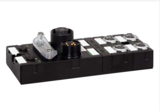
Product may differ from Image

Cube67+ EtherCAT Connection cables are in the online shop under "Connection Technology". Housing fully potted.